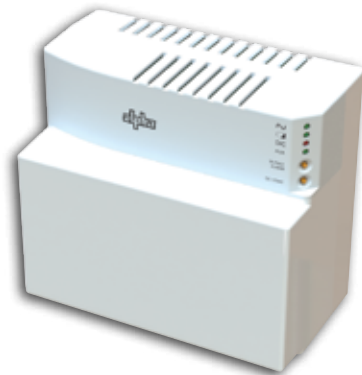
FP1215, FP1232 & FP1250 with 12Ah battery