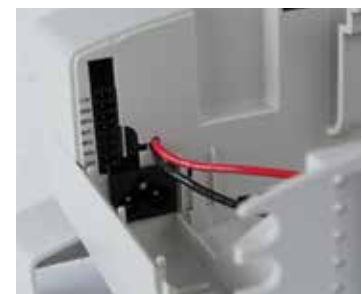
Output Cable Connection