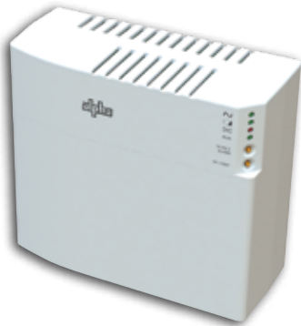
FP1215 & FP1232 with 5 to 8Ah battery